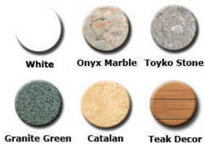
Table Base Colors